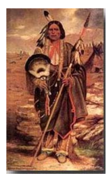
Artist's illustration of a Comanche warrior based upon a photograph of Chief Quannah Parker.

In 1858, a combined force consisting of Indian Texas Rangers from the Brazos Reservation, Texas Rangers, and members of the U.S. military took the settlers' fight into Comancheria and attacked a camp along the Canadian River. The Rangers from the Brazos Reservation were led by Texas Ranger Hall of Fame inductee Sul