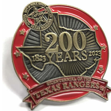
Texas Ranger Hall of Fame Bicentennial Pin

Please click here to learn more about the program.