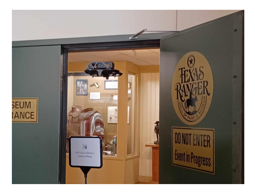
Please click here to watch the fly over on Facebook.

Enjoy a bird's eye view from a drone on a flight from the grounds outside and into the Texas Ranger Hall of Fame and Museum, soaring through exhibits, the rotunda, gift shop, the Lone Ranger exhibit, and Knox Center. The video airs on MyWacoTV station, on City of Waco - Public Information and TRHFM Facebook as well as on the Museum's website.