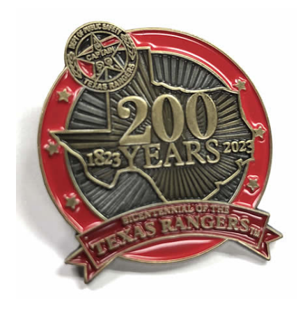
Texas Ranger Hall of Fame Bicentennial Pin

Please click here to learn more about the program.