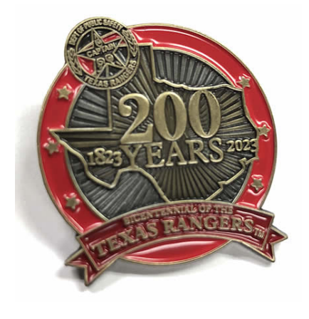
Texas Ranger Hall of Fame Bicentennial Pin

Please <u>click here</u> to learn more about the program.