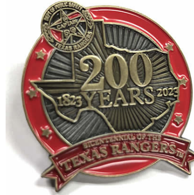
Texas Ranger Hall of Fame Bicentennial Pin

Please click here to learn more about the program.