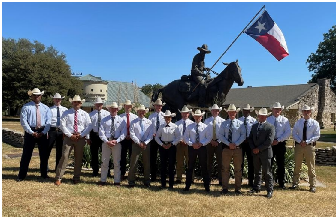
Photograph of Texas Ranger personnel at the Crimes Against Public Trust Conference held in Waco at the Texas Ranger Museum on October 11 – 13, 2022.