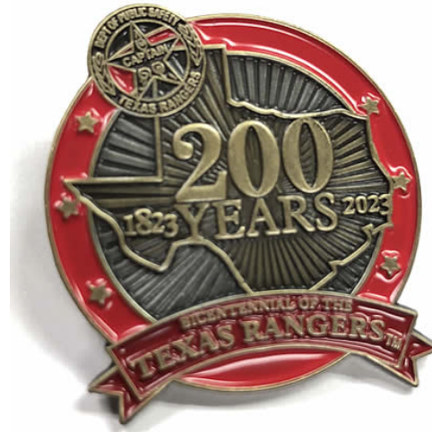
Official Texas Rangers Bicentennial Pin

$90 of the contribution qualifies as a charitable contribution. The Texas Ranger Hall of Fame is a 170(c) government-owned nonprofit.