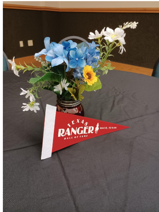
A table decoration from TRHFM's evening event.

The Texas Association of Museums strengthens the Texas museum community through collaborations, connections, professional development, and advocacy.