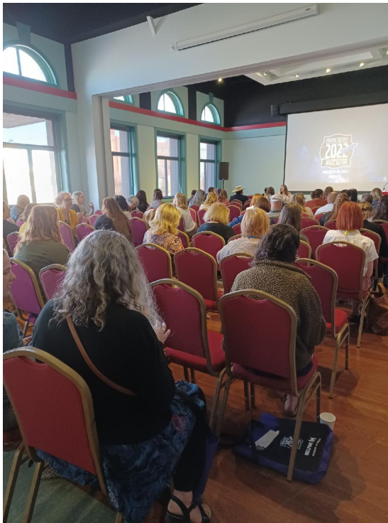
TAM Attendees getting ready for a presentation.

Overall, it was a great couple of days with a perfect combination of learning and fun. We were happy to welcome in our fellow museum professionals to our wonderful city!