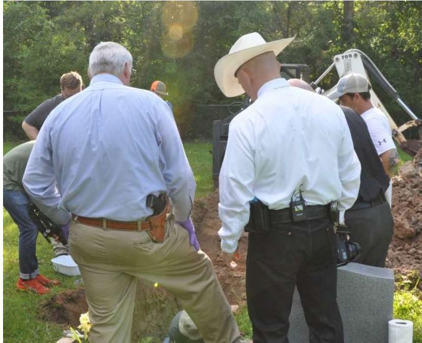
A suspect's body being exhumed for DNA comparison.