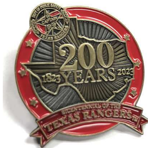
Official Texas Rangers Bicentennial Pin

$90 of the contribution qualifies as a charitable contribution. The Texas Ranger Hall of Fame is a 170(c) government-owned nonprofit.