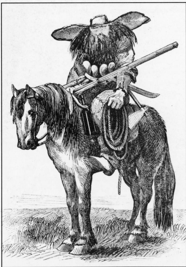
Harper’s Weekly, 1861. Hardin, Stephen. Elite Series: The Texas Rangers . London: Osprey Publishing, 1991.

The [people of Mexico] believe them to be a sort of semi-civilized, half-man, half devil, with a slight mixture of lion and the snapping turtle, and have a more holy horror of them than they have of the evil saint himself.”