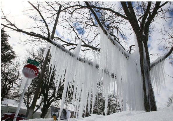
Ice forms on a tree in Waco on Tuesday.

An arctic blast rolled into Texas on Thursday, Feb. 11th - the worst in 10 years. It lingered for days causing massive, statewide failures in electrical generation. Over four million Texans were without power and many without water.