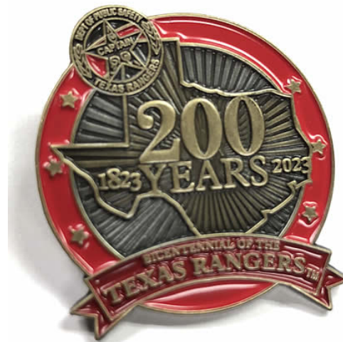
Official Texas Rangers Bicentennial Pin

Please click here to learn more about the program.