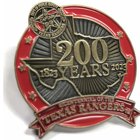
Official Texas Rangers Bicentennial Pin

Please click here to learn more about the program.