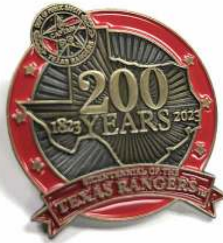
Official Texas Rangers Bicentennial Pin

Trademarked by the Texas Dept. of Public Safety Designed by the Texas Ranger Hall of Fame and Museum