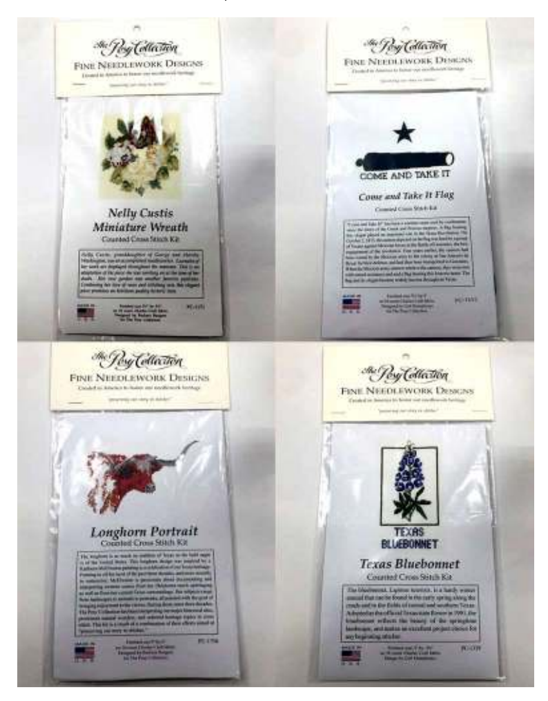
Large Cross-Stitch $16.50 + Tax

To shop more items available for purchase, please visit our <u>Gift Shop online</u>, or in person 9am to 4:30pm daily. You never have to pay admission to shop. Sales from the Gift Shop benefit the preservation and education activities of the Museum. Please call (877) 750-8631 or email <a href="mailto:thestore@texasranger.org">thestore@texasranger.org</a> to order. We ship worldwide. Thank you!