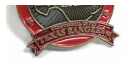
Official Texas Rangers Bicentennial Pin

Please click here to learn more about the program.