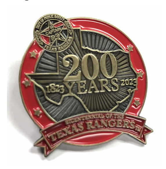
Official Texas Rangers Bicentennial Pin Trademarked by the Texas Dept. of Public Safety Designed by the Texas Ranger Hall of Fame and Museum

Please <u>click here</u> to learn more about the program.