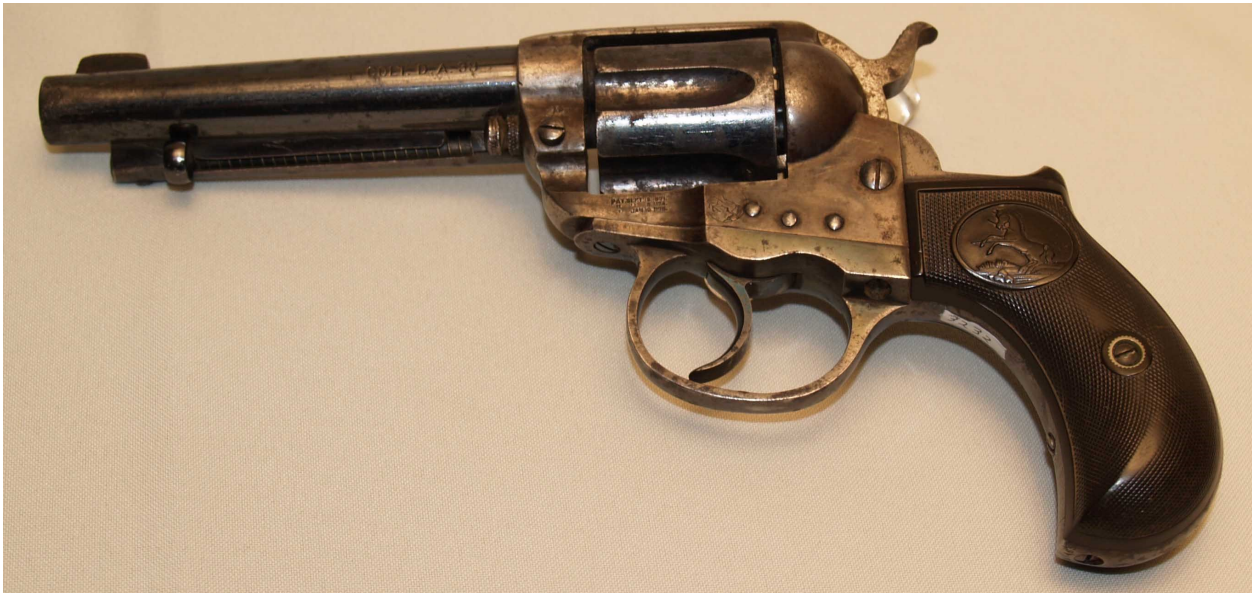
Model 1877 Lightning, Cat. No. 3232