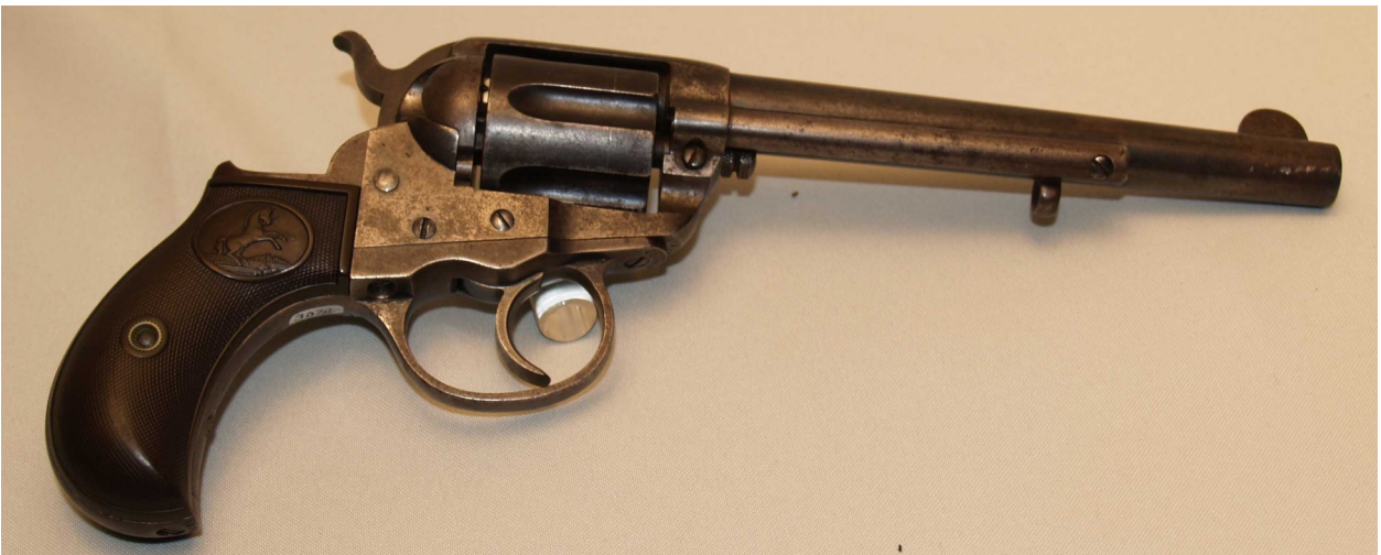
Model 1877 Thunderer, Cat. No. 3078

Although production of this firearm continued into the 20 th century, it was never adapted to smokeless powder. A warning against the use of smokeless powder was made with guns shipped from 1898 to 1909.