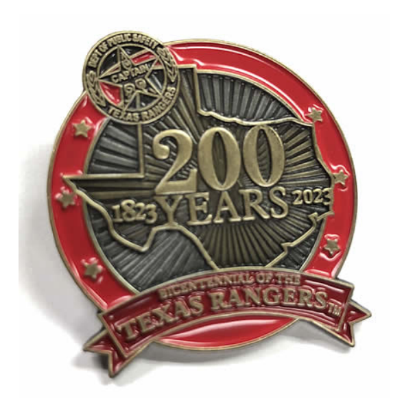
Official Texas Rangers Bicentennial Pin Trademarked by the Texas Dept. of Public Safety Designed by the Texas Ranger Hall of Fame and Museum

Please <u>click here</u> to learn more about the program.