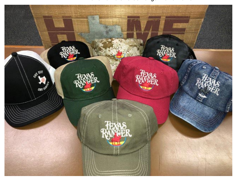
A selection of the baseball hats at the TRHFM Store

To shop more items available for purchase, please visit our Gift Shop online , or in person 9am to 4:30pm daily. You never have to pay admission to shop.