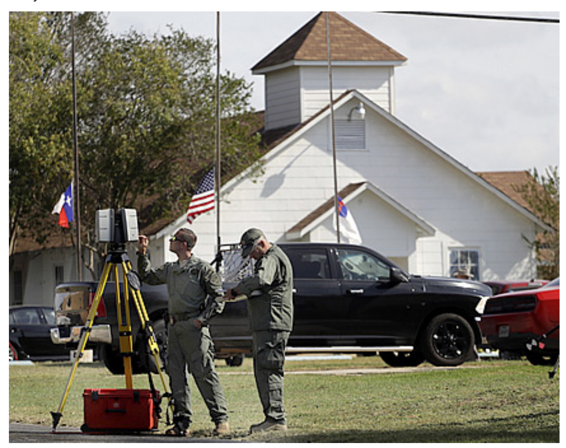
Texas Rangers utilize a Leica scanner following the Sutherland Springs Church shooting in 2017.

the Sutherland Springs Church shooting in 2017, and the Austin bombings in 2018 among many others.