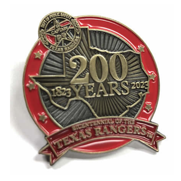
Official Texas Rangers Bicentennial Pin

$90 of the contribution qualifies as a charitable contribution for Federal Income