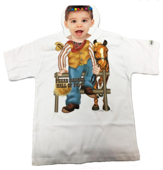
"Add a Kid" Cowboy T-Shirt, Youth Kids 2T, 3T and 4T $16.00 + Tax