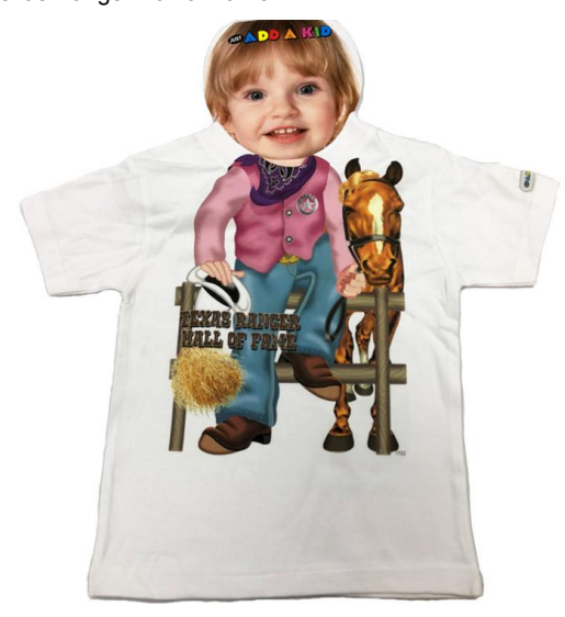
"Add a Kid" Cowgirl T-Shirt, Youth Kids 2T, 3T and 4T $16.00 + Tax