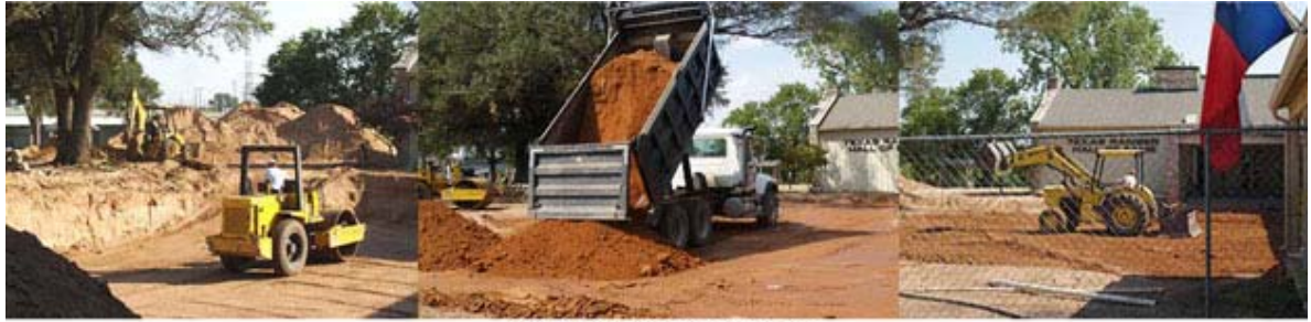
Step 1: Compact dirt foundation

Work on the Tobin and Anne Armstrong Texas Ranger Research Center is rapidly progressing. The soil has been compacted to assure the pier-and-beam foundation will adequately support the structure on the banks of the Brazos River. Completion is expected during the spring of 2012.