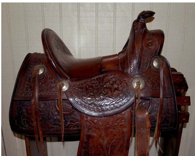
Pueblo Saddle, S. C. Gallup Saddlery Company