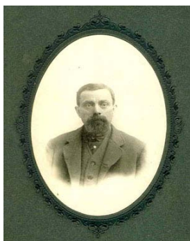
Photograph of Texas Ranger Charles Dissler

Texas Ranger badge playing cards are on sale (now $1.50 each) for a limited time. Get them while they last. Call (254) 750-8631 or email the store .