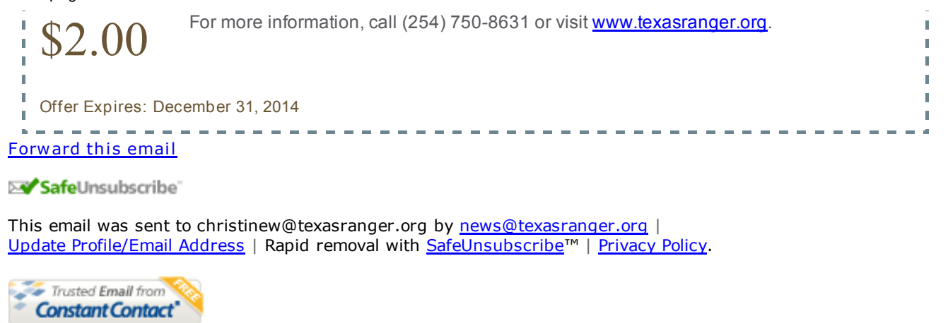
Try it FREE today.