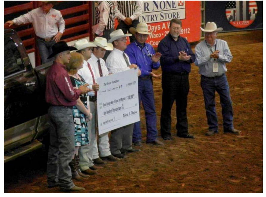
The RAM 1500 was named the Truck of Texas by the Texas Auto Writers Association. RAM is proud of this award, and is proud of its connection to Texas Heritage.

Waco Center for Youth Texas Department of Public Safety HOTRAC Waco Fire Department Reserve Officers Association of the USA Department of Assistive and Rehabilitative Services Strategic Communication Research class at Baylor University