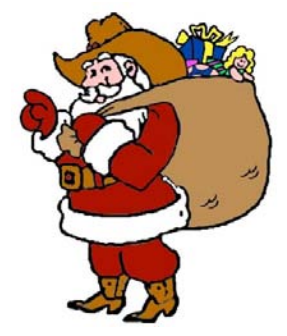
The Hall of Fame and Museum is closed on Thanksgiving, Christmas and New Year's Day so that staff may spend time with their families. Our regular hours of operation are 9:00 am to 5:00 pm daily with the last guest admitted at 4:30 pm. The Gift Shop also closes at 4:30 pm.