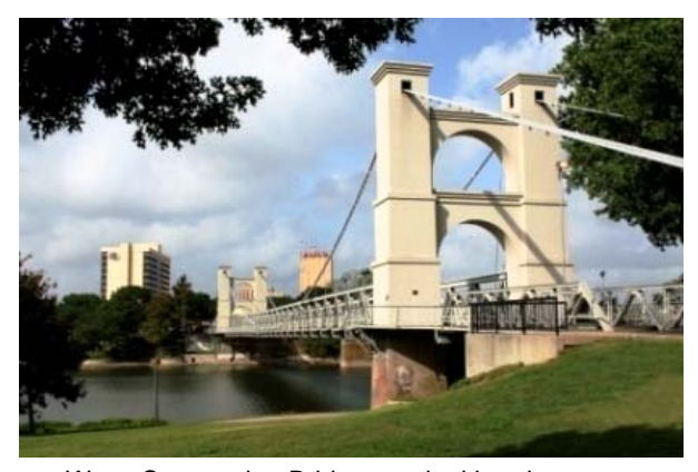
Waco Suspension Bridge overlooking downtown

The "Texas Main Street" designation is awarded to cities that are committed to the development and preservation of their downtown. If you haven't been to Waco in a few years, you'll be surprised at how much is happening!