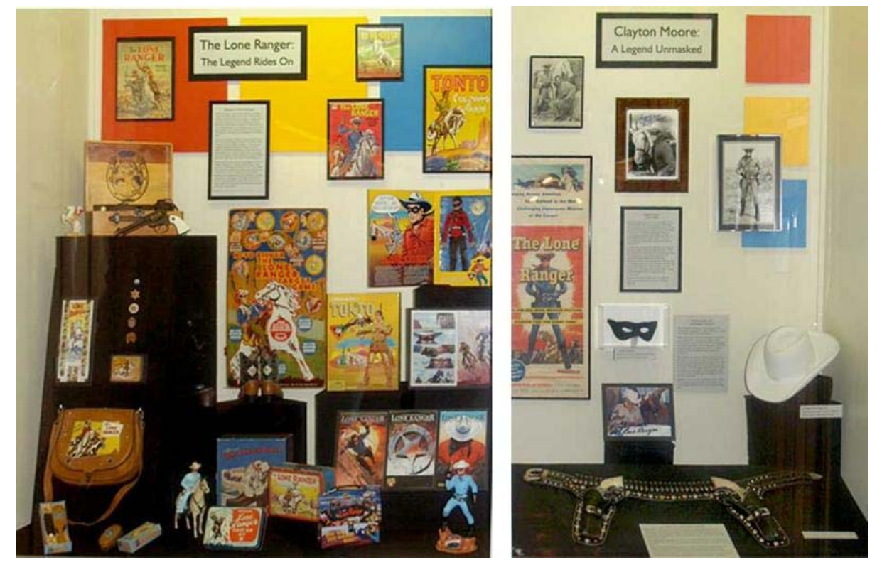
Left: The Lone Ranger exhibit