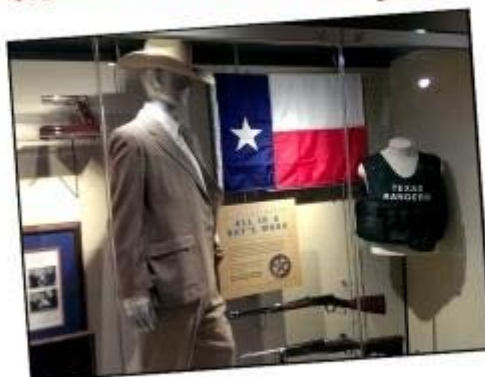
Texas Ranger Hall of Fame 100 Texas Ranger Trail Waco, TX 76706