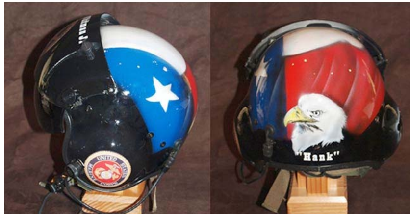
Front of Helmet Left Side of Helmet

In June H-E-B grocery stores started carrying the Texas Ranger Foods line of salsas and quesos. It is a cooperative project between the Museum and ChefEase. Sales of the products benefit the educational and preservational activities of the Museum. Visit your local H-E-B today!