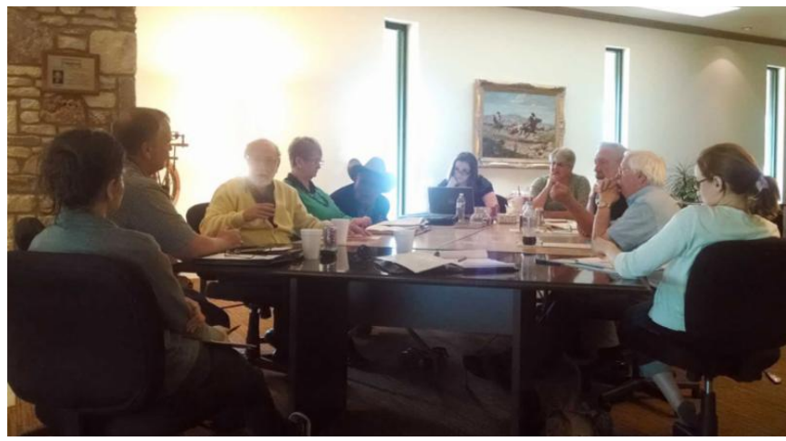
The participants are responsible for dozens of books and articles as well as unpublished research on the Texas Rangers and the Old West: