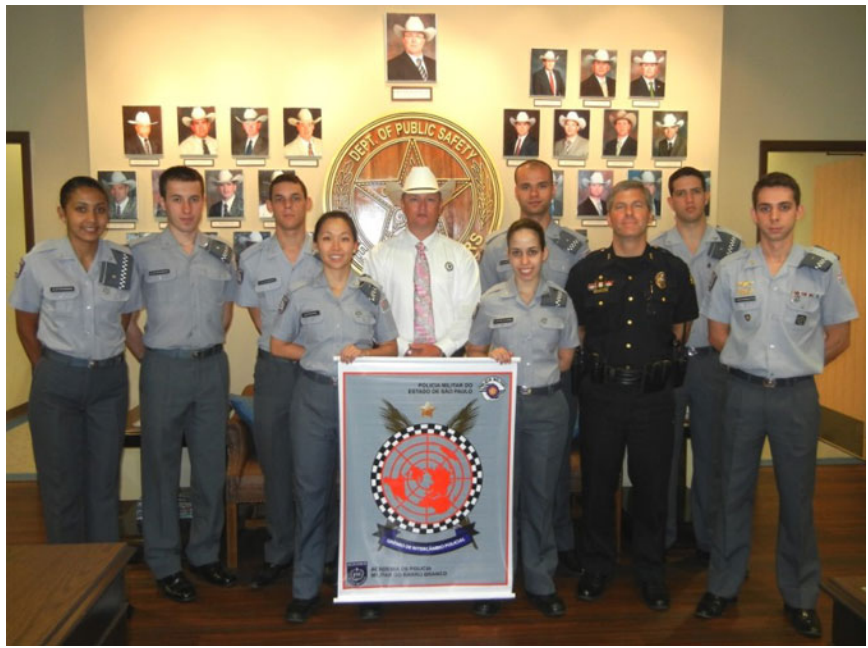
Facts about the Academy and Sao Paulo: