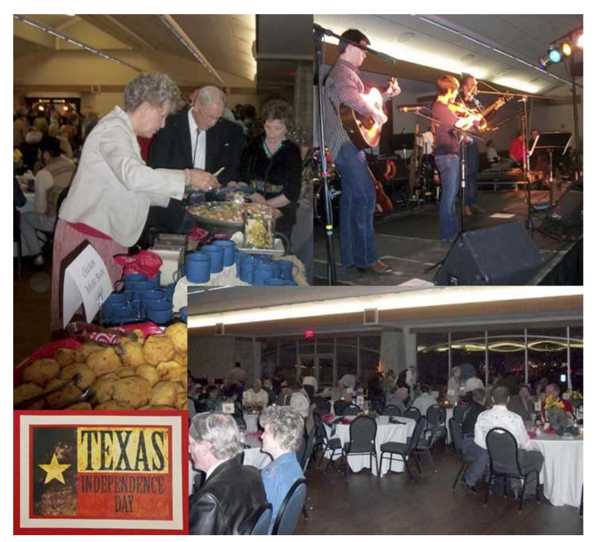
A special thanks to Historic Waco Foundation for the photographs.

band; and toured the Museum with the Foundation's Belles and Beaus. The Belles and Beaus are local high school student volunteers dressed in period costume. Attendees dined on Texas delicacies, including bacon-wrapped quail, buffalo sliders, sweet potatoes, chicken chili and berry cobbler. Valley Mills Vineyards had a wine tasting bar with samples of their different wines. We would like to recognize the other major sponsors: Johnson Roofing, Talon Asset Management, Glazers, and San Saba Deer Hunters. Due to the success of the event, the Museum and Foundation are collaborating again for a Civil War summer camp in June.