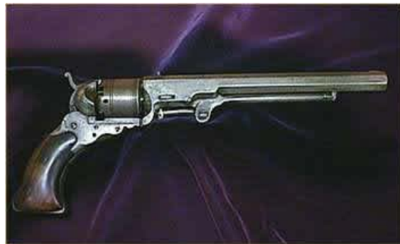
Colt's .36 Caliber No. 5 Texas or Holster Model Patterson Revolver