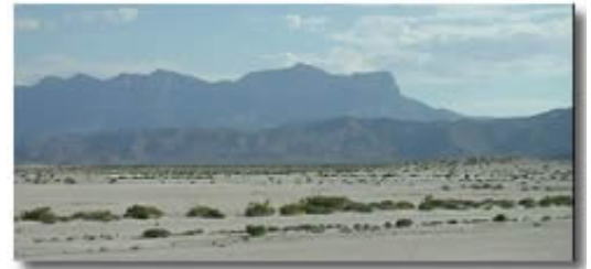
The El Paso Salt Flats, Focus of the "Salt War"